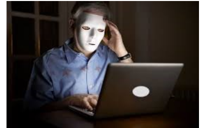
Learn more at LegalDictionary.net [search stalking].

Stalking is “repeated unwanted attention and harassment directed at a specific person causing him or her to fear harm.” Stalking is a crime. Although similar definitions exist in every state, unfortunately many perpetrators ignore or incorrectly “compare out” of the definition. They believe whatever they are doing isn’t stalking. Many behaviors can constitute stalking, including unwanted contacts via social media, sending unwanted gifts no matter how well-intentioned, contacting the victim’s friends, hiring an investigator, or even going through the victim’s garbage. Could your behavior constitute stalking?