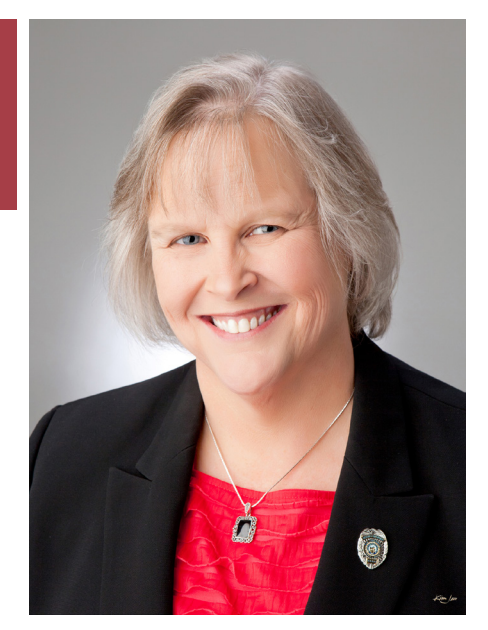
You partnered with law enforcement to begin a program that shared information regarding the location of registered sex offenders. What is OffenderWatch and how does it operate?

Due to the incredible downturn in the economy, we had a 12.5 percent cut within the first four years I took office. I had two budget cuts within the first 30 days. We quickly had to determine what we could do without. I went through all of our expenditures, line by line, and eliminated everything that I could. However, upwards of 95 percent of our budget is personnel. The amount you can cut from operating costs is limited. So, I pursued grants aggressively. Since I became DA, our office has received over a million dollars in grants. We still start each fiscal year in deficit. But the grant funds, specifically the Southwest Border Prosecution Initiative, have kept the lights on and the doors open during these difficult times. We still have a long way to recovery, but we are headed in the right direction.