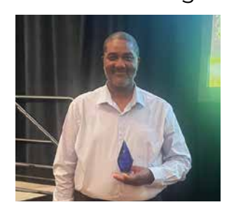
ORGANIZATION: POJOAQUE PUEBLO TRIBAL COURT