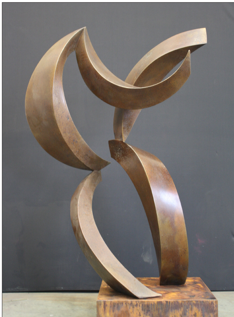
Rythm , by Gino Miles (see page 3)