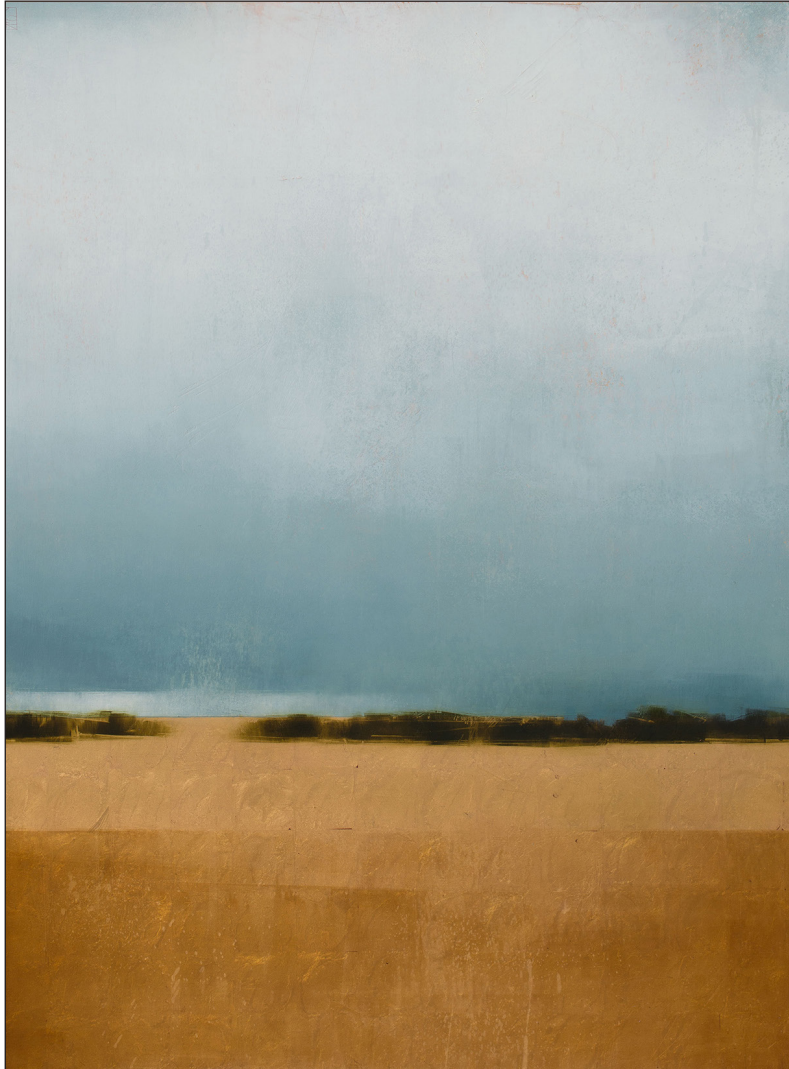
Silence Comes , by Pauline Ziegen (see page 4)