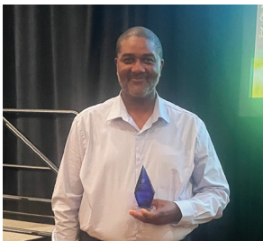
ORGANIZATION: POJOAQUE PUEBLO TRIBAL COURT

Outstanding Legal Organization or Program Award