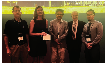
PROGRAM: INTELLECTUAL PROPERTY PRO BONO FAIR