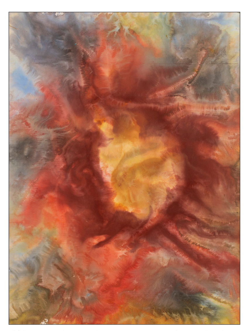
Club, by Brian McPartlon (see page 4)