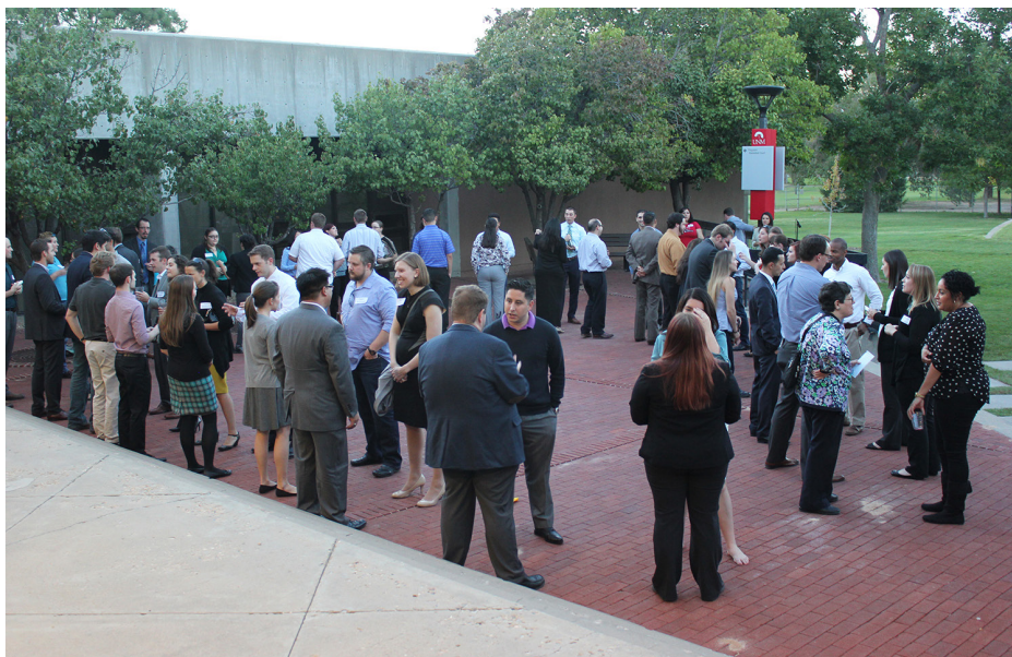
Attorney mentors and student mentees practice their speed networking on the UNM School of Law patio