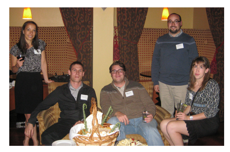
New admittees to the NM Bar at reception