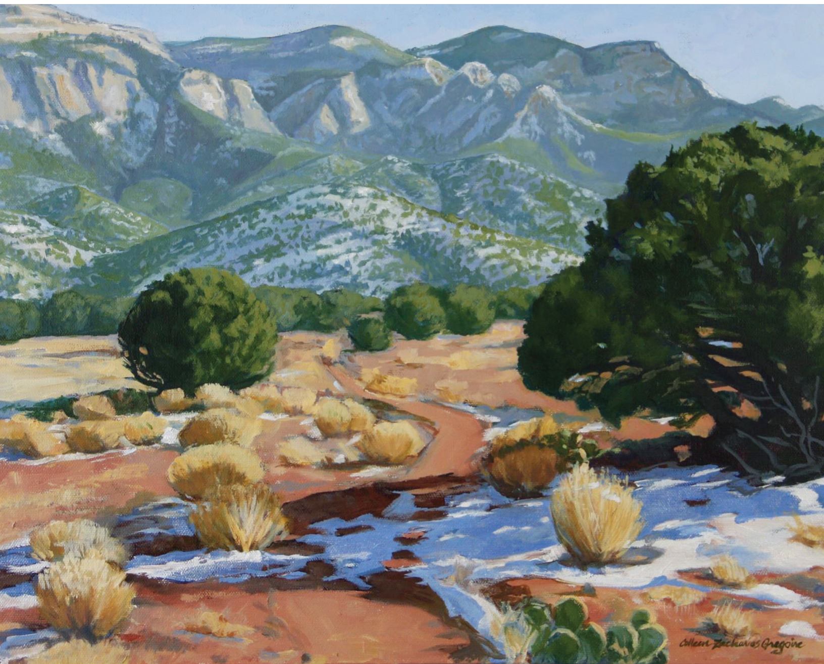
Snow Shadows on Mustang Alley